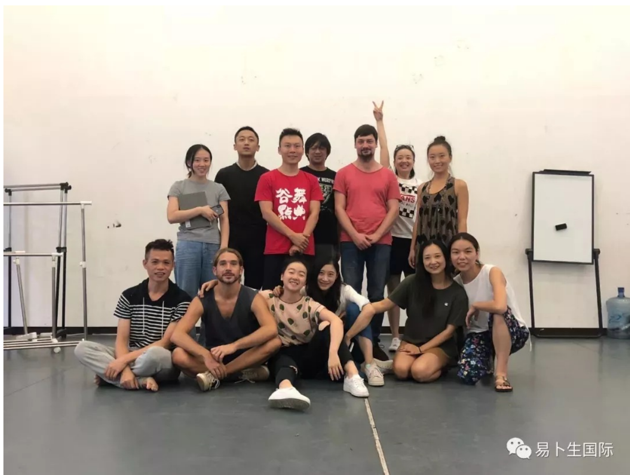
A group photo

I summarized my thoughts recently. The purpose of my participation in the workshop was not to become a dramaturge. One of my reasons is, in an era where interaction is very important, as an independent art creator I need to express my intentions and ability to think critically. This would enable me to work better with a team and to make choices and combinations in the face of specific challenges or difficulties. I want to take risks with the desire to re-start, instead of stressing what I have; to discover new possibilities and tools, rather than internalizing one way into a model, unimagined space and counter-equivalent elements; to transform contradiction into favorable performance condition/foundation.