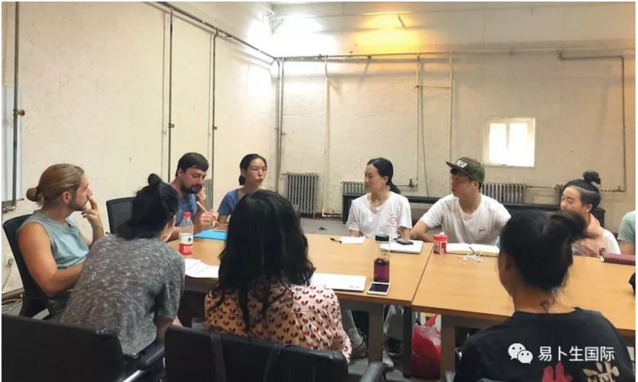
Round table discussion