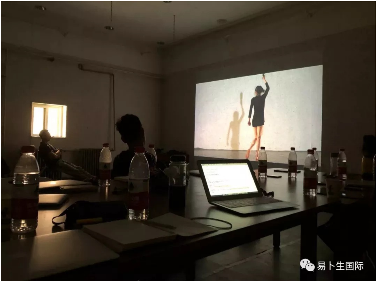
Sharing art works for discussion